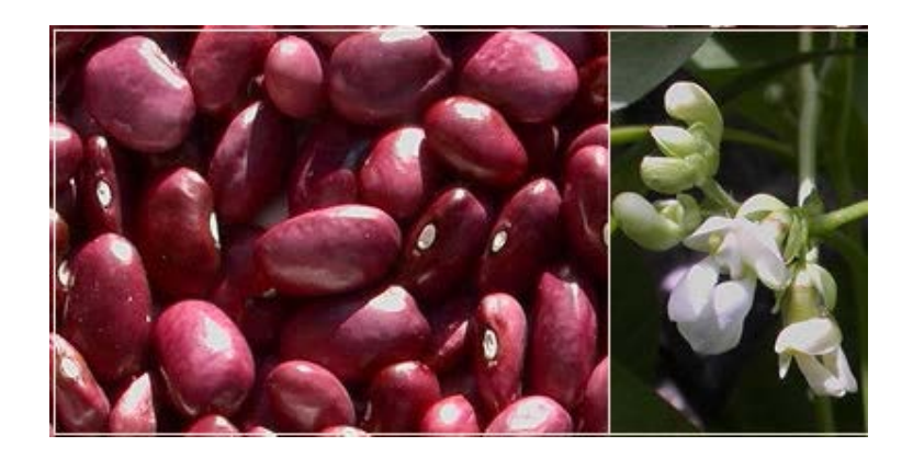
Purple Beans (Phaseolus vulgaris)