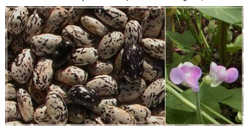
Hopi Black Pinto Beans (Phaseolus vulgaris)