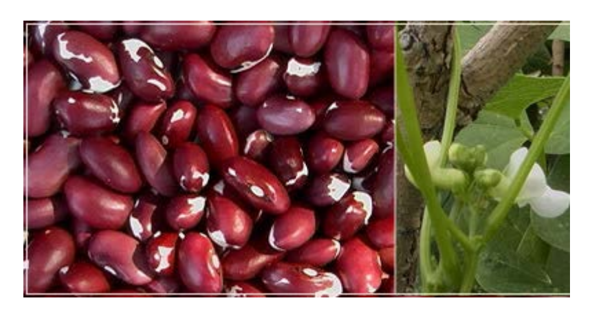
Anasazi Beans(Phaseolus vulgaris)

Apply 25 of FYM and 50 kg P and 25 kg K/ha as basal dose. 25 kg N and 25 kg of K/ha are applied between 20-25 days after sowing and application of remaining 25 kg of N is done between 40-45 days.