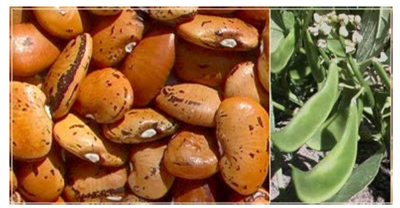
Hopi Yellow Lima Beans - "Sikyahatiko" - Phaseolus lunatus

Lime bean is a cool season vegetable requiring dry and cool climate with an average rainfall of 50-62.5 cm. Compared to other legumes, it is a long duration crop and is retained in field for 9 months. Lima bean is an important crop in Maharashtra.