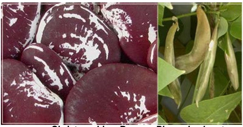
Christmas Lima Beans - Phaseolus lunatus