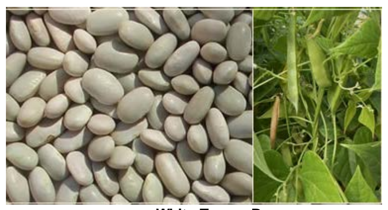
White Tepary Beans Phaseolus acutifolius